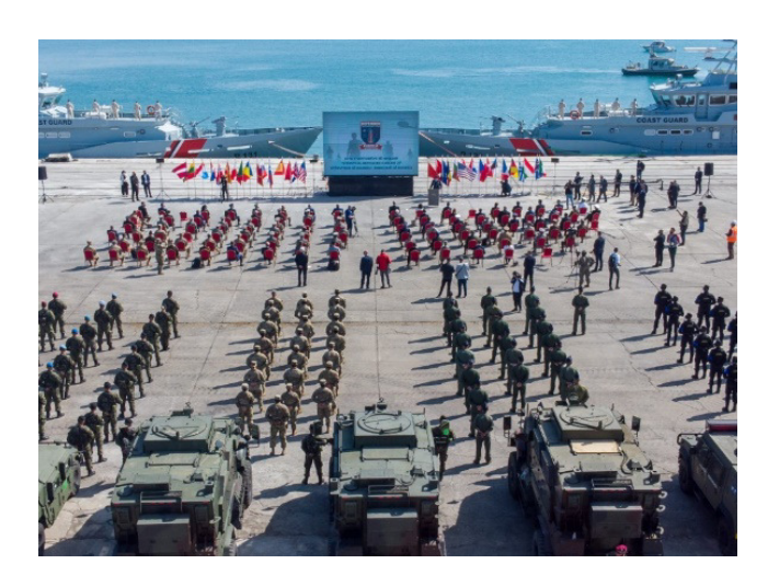
Defender 21, 2021, DV Day

Also, Romanian military naval forces took part in exercises organized by neighboring nations, such as 'Sea Breeze' between June 28 and July 10, 2020, the USA and Ukraine being the host countries, and the participation totaling about 2000 soldiers from Bulgaria, Georgia, Norway, Romania, Spain, and Turkey.<sup>5</sup>