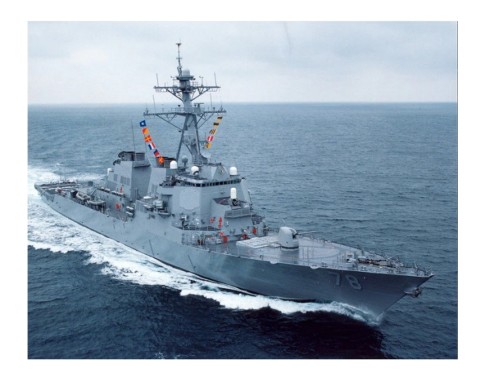
The U.S. warship Porter, shown here in an undated photo, steamed into the Black Sea Sunday, July 19, 2020.

Also, Romanian military naval forces took part in exercises organized by neighboring nations, such as 'Sea Breeze' between June 28 and July 10, 2020, the USA and Ukraine being the host countries, and the participation totaling about 2000 soldiers from Bulgaria, Georgia, Norway, Romania, Spain, and Turkey.<sup>5</sup>